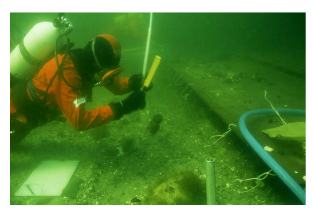
Drwing and levelling with a garden hose at Møllegabet II, Denmark.