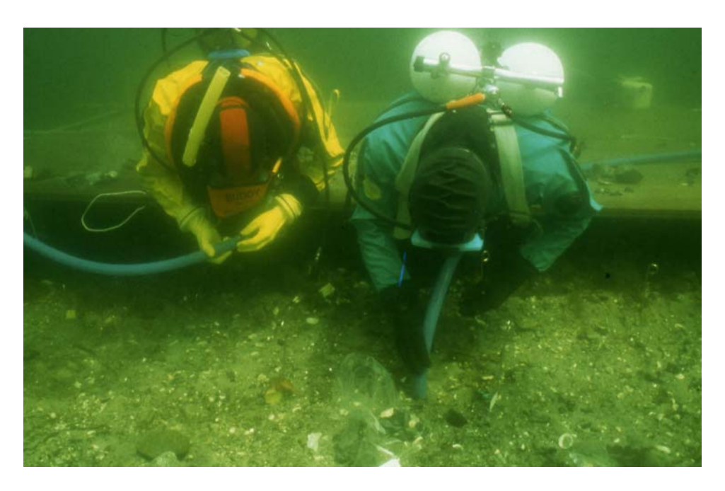
Divers excavating the Mesolithic pit dwelling at M \emptyset llegabet II, Denmark, from a wooden platform positioned above the cultural layer under excavation.