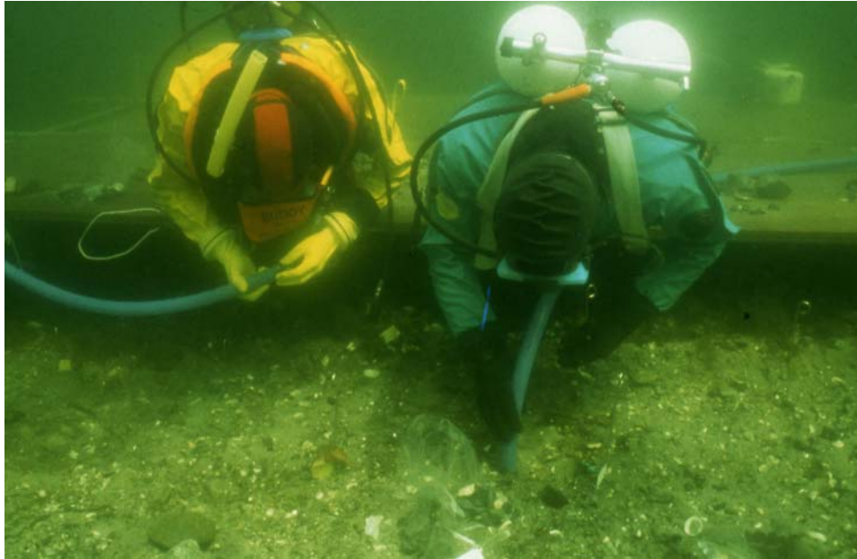
Divers excavating the Mesolithic pit dwelling at Møllegabet II, Denmark, from a wooden platform positioned above the cultural layer under excavation.

Skaarup, J. and Grøn, O.2004: Møllegabet II. A submerged Mesolithic settlement in southern Denmark. BAR International Series 1328, Oxford.